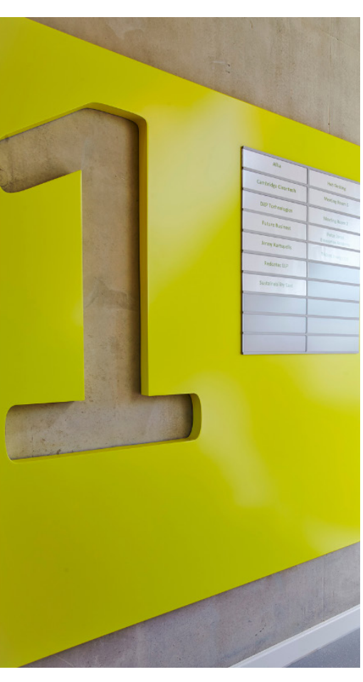
OFFICE IN ALLIA FUTURE BUSINESS CENTRE CAMBRIDGE CAMPUS F.08